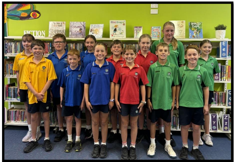
SEMESTER 1 - CLASS SRC STUDENTS